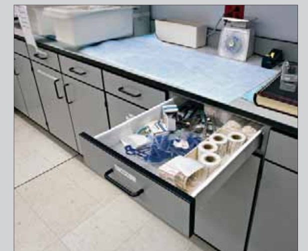
PICTURE INDEX (CLOCKWISE FROM TOP LEFT): 1 PHARMACY WORK AREA; 2 LAB AREA WITH FOG LAMINATE CABINET BODIES AND TRESPA® WORKTOPS; 3 PHARMACY WORK AREA PERSPECTIVE LINE ART; 4 LAB AREA DRAWER SHOT; 5 PLAN VIEW LINE ART OF PHARMACY WORK AREA; 6 PHARMACY PRODUCTION AREA

WORK SURFACES: Trespa® in laboratories, Corian® on nurses’ stations, Goelst laminate in pharmacies