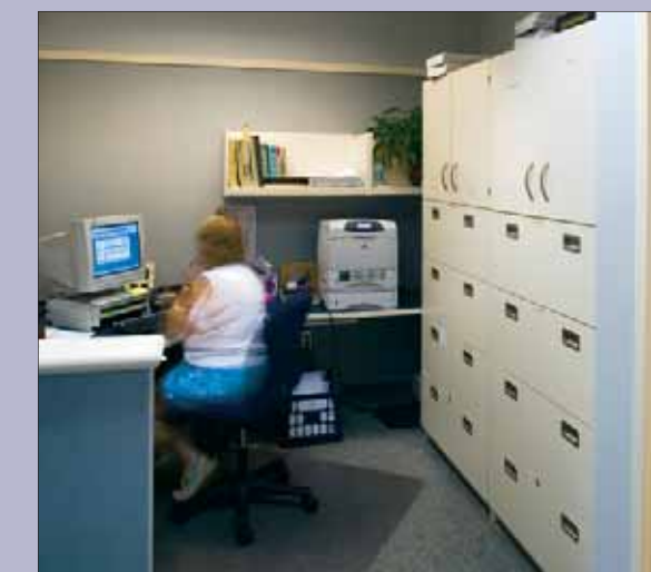
PICTURE INDEX (CLOCKWISE FROM TOP LEFT): 1 RECEPTION AREA; 2 HALLWAY FILING AREA; 3 PERSPECTIVE LINE ART OF RECEPTION AREA AND PARALLEL HALLWAY FILING SYSTEM; 4 OFFICE AREA; 5 PLAN VIEW LINE ART OF RECEPTION AREA; 6 LIBRARY/RESOURCE AREA

WORK SURFACES: Navy Grafix laminate worktops