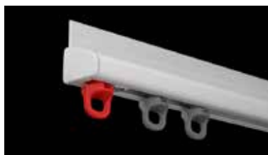
Example of profile 4301 with end cap 4353 with red LR glider 4007-20 acting as end stop and grey LR gliders LR 4007-10.

Recommendation: It is recommended that a maximum of 10 LRS gliders are used per metre of track.